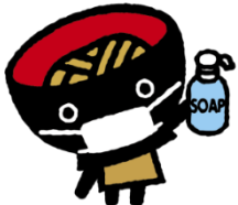
<Sobacchi (Hand-wash ver.)>