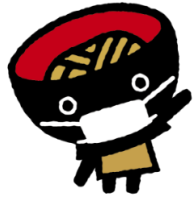
<Sobacchi (Mask ver.)>