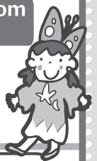
Exhibit: Conveying "Thank You" to the World 展示: 「感恩」向世界传递

This exhibit will display supporting messages from all over the world and messages of thanks from survivors. Let's spread these messages from all over the world!